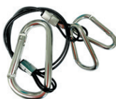
• Hanging hardware